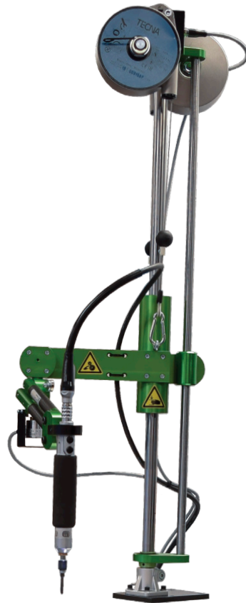
FTA Folding Torque Arm